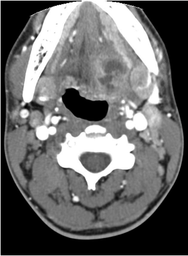
FIGURE 1. CT with contrast of the neck of patient No. 2 demonstrating a multiloculated fluid collection of the left sublingual space.

Carter et al. Community Acquired MRSA Facial Abscesses. J Oral Maxillofac Surg 2005.